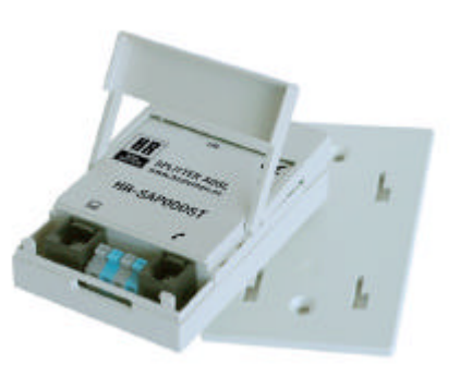
Two connection options

The ADSL splitter must be placed in the entrance line point before any other equipment from the internal network. Fixing: With a plastic holder and 2 screws.